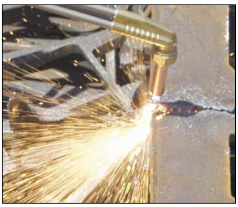
Bulldog tips put more muscle into your cutting job.