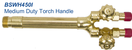
BSWH450I Medium Duty Torch Handle