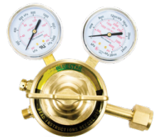
BS4501540 450 Series Oxygen Regulator CGA-540