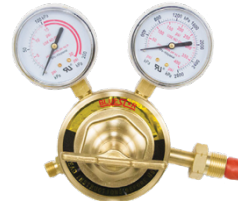
BS4501510 450 Series Acetylene Regulator CGA-510