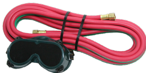
Blue Star Standard Goggles and 12' x 1/4" R-Grade twin hose