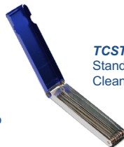
TCSTDI Standard Tip Cleaner